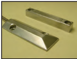
Open/Close Sends an alarm when door/manway cover has been opened or closed