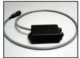
Impact A 2G, 3G or 5G customer-programmable, two-axis impact accelerometer