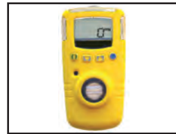
Chemical Sniffer Sends alarm when reaching customer-defined alarm presets; can sniff chlorine, ammonia and many other gases