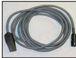
Temperature Sends current and average temperature since last communication; sends alarm if temperature reaches unsafe levels