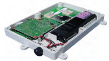
Long-life internal battery; no external antenna