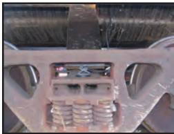
Empty/Full Sends an alarm when vehicle has reached empty status or is full

State-of-the-art sensors that provide value-added information about your railcars, trailers or containers from virtually anywhere in the world.